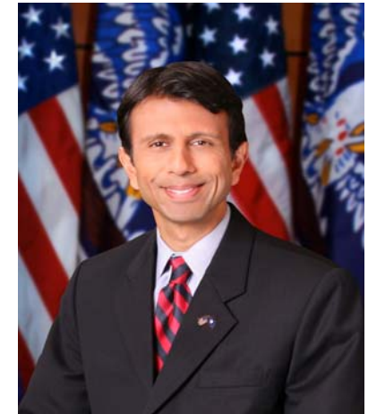
Honorable Bobby Jindal

With the knowledge and understanding that conservation, wise management and use of our State's natural resources is essential to the health, happiness, welfare and economic well-being of Louisiana's citizens; and with the belief that proper recognition of conservation efforts promotes wise resource management and use,